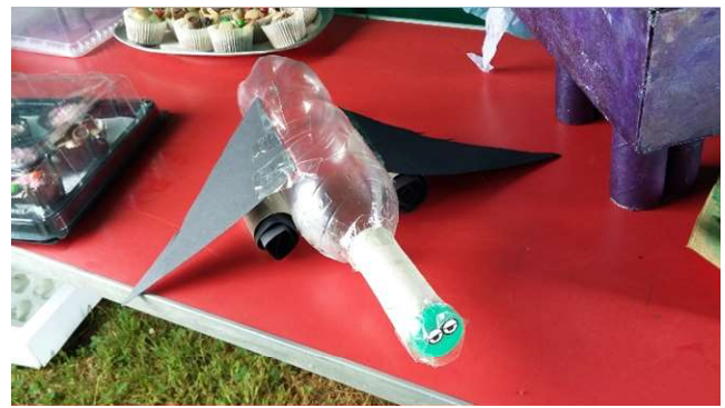
Junk Model - Yellow Class winning entry: Alfie J