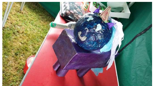
Junk Model - Blue Class winning entry: Caitin R