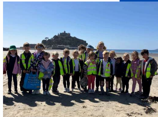
Wow! What an amazing day Maple Class had at Penzance Gymnastics and on St Michael's Mount. The children thoroughly enjoyed their trip.

FULL INFORMATION DETAILED ON PAGE 3 & 4 OF THIS NEWSLETTER